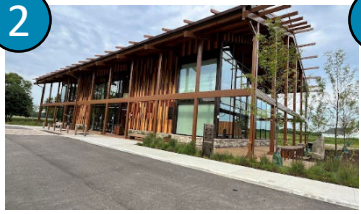
2 Great Council State Park 1587 US Hwy 68 North Xenia, OH 45385