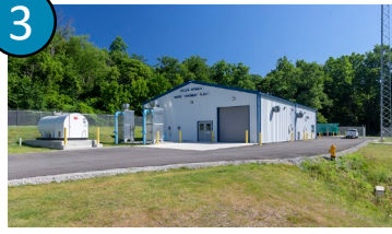
3 Yellow Springs WTP 640 Jacoby Rd Yellow Springs, OH 45387