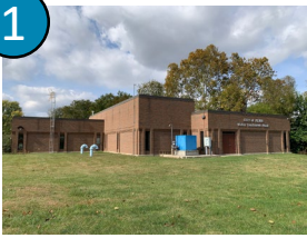
1 Xenia Water Treatment Plant 1831 US Hwy 68 North Xenia, OH 45385