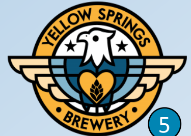
5 Yellow Springs Brewery 305 Walnut Street Yellow Springs, OH 45387

$50 Pre-registered AWWA Members received by October 11th